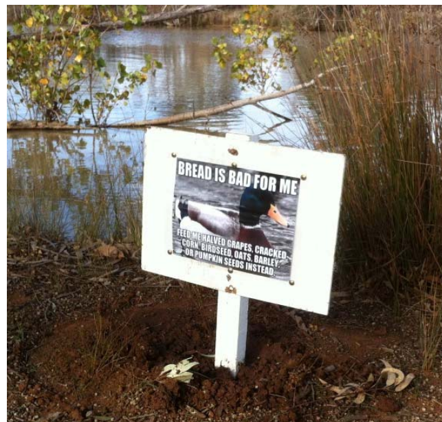
New sign beside the Lake

If you use Facebook and/or Twitter you may want to keep up with information via the Friends of the Melton Botanic Garden Group. Type "Melton Botanic Garden" into the search box and you should