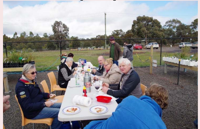
Having lunch together