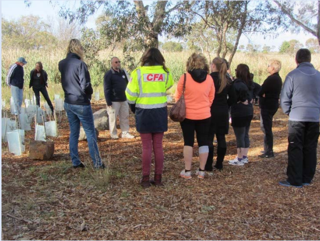
Beneath the gum trees beside the lake

On Friday 29 th May Friends of Melton Botanic Garden hosted a Reconciliation Week tour through the Garden.