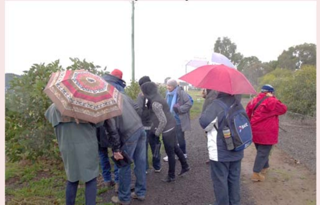
Some of the group looking at the eucalypts