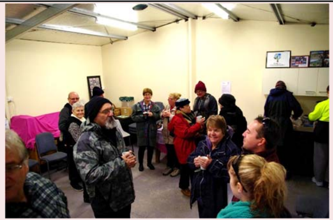
APS Geelong - Morning tea on arrival

It was a pretty cool day which included a cold wind, showers and finally sunshine. We had morning tea, a tour of the garden and lunch together. With great company, a sizeable donation to FMBG from APS Geelong and plant sales it was a very successful day. Many thanks to FMBG members who helped.