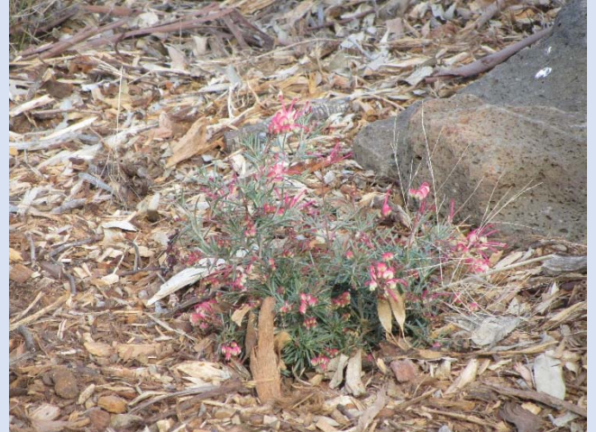
Grevillea rosmarinifolia 'Lara Dwarf'